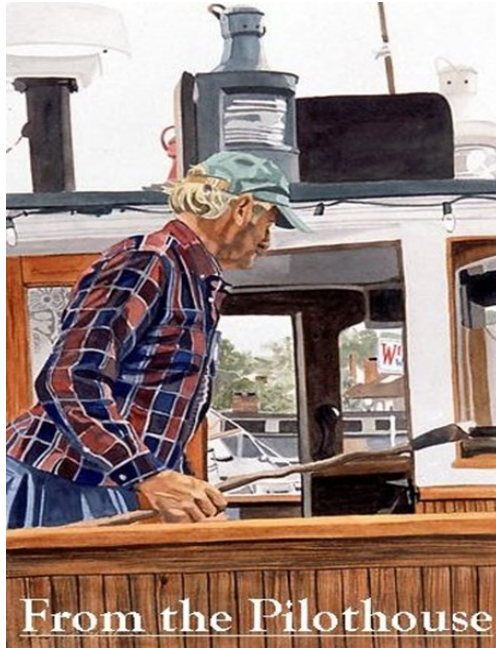
From the Pilothouse